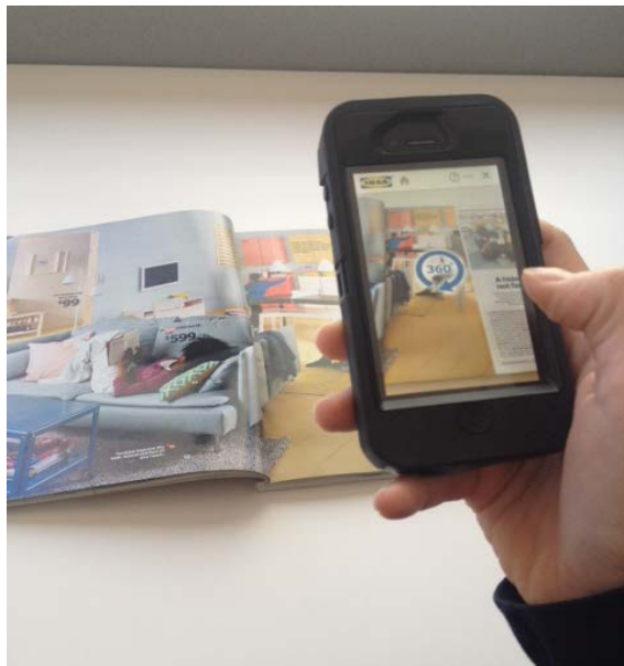
Figure 3: Example of Augmented Reality Application with a Magazine

They appreciated that the mailpiece provided a source for more information or gave them the ability to purchase immediately.