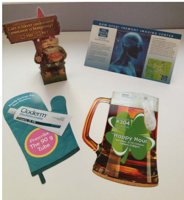
Figure 2: Some Innovatively Designed Mailpieces Shared During Focus Groups

Some focus group participants said that they would be more likely to keep this kind of mail than regular mail. A few participants even said they would share these unique mailpieces with friends. One Digital Native said he would be more likely to check the mail if it contained these types of pieces. A few participants said if they kept the mailpiece, it would be for the innovative features, not the content of the message.